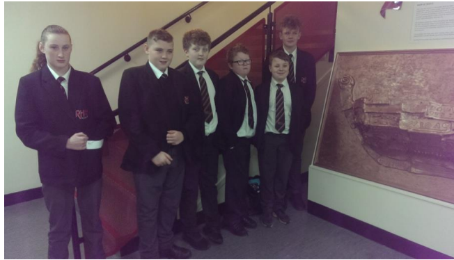
Students of Red House Academy, Sunderland and the Ship of Souls they created with MBC Ceramics

JtoJ Newcastle members are invited to run workshops on human rights in school and University settings. And JtoJ was invited to be part of Freedom City 2017 remembering Martin Luther King's 1967 visit which will culminate in a huge event on the Tyne Bridge on October 29 th .