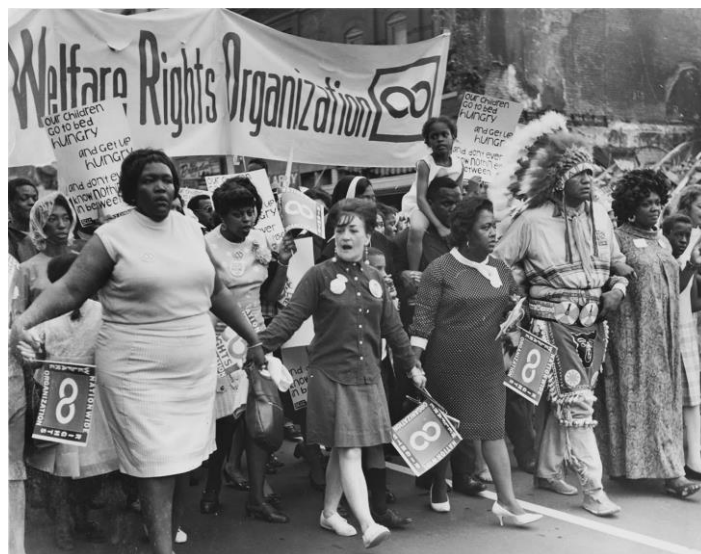
The National Welfare Rights Organization marching to end hunger as part of the Poor People's Campaign, 1968.

We have our plan and we will follow it, but we are also an organic movement open to whatever this year will bring. It is wonderful to have you with us, in fact you are 'us'. Thank you and onwards!