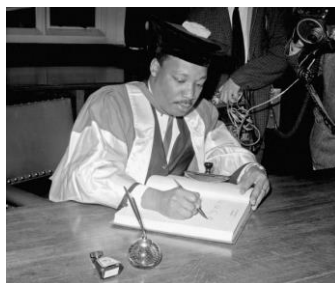
Dr. Martin Luther King Jr. receiving his honorary degree from Newcastle University, 1967

JtoJ Newcastle members are invited to run workshops on human rights in school and University settings. And JtoJ was invited to be part of Freedom City 2017 remembering Martin Luther King's 1967 visit which will culminate in a huge event on the Tyne Bridge on October 29 th .