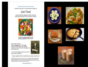
Just Food a book of delicious recipes chosen by social activists, sold in aid of JtoJ