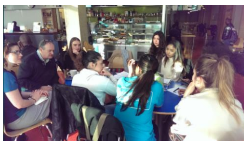
JtoJ London team meeting at Idea Store, Whitechapel