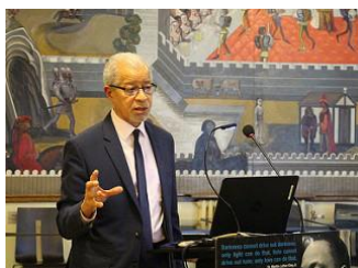
JtoJ patron Lord Herman Ouseley, JtoJ Morley College launch, MLK Day, January 2017