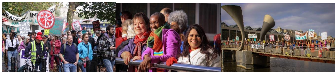
Journey to Justice in Bristol: Hands Across the City

Wherever the exhibition is displayed it includes a section telling local stories of social action from the past and present, often through the arts and researched by local people. The exhibition is a catalyst for a complementary education and arts programme which harnesses local energies and histories, planned and delivered by local partners and inspiring continued activity after it has gone. Between April 2017 and March 2018 we ran the project in Nottingham, Bristol and Newham in East London. For a film of the Newham launch go to https://vimeo.com/293990807 .