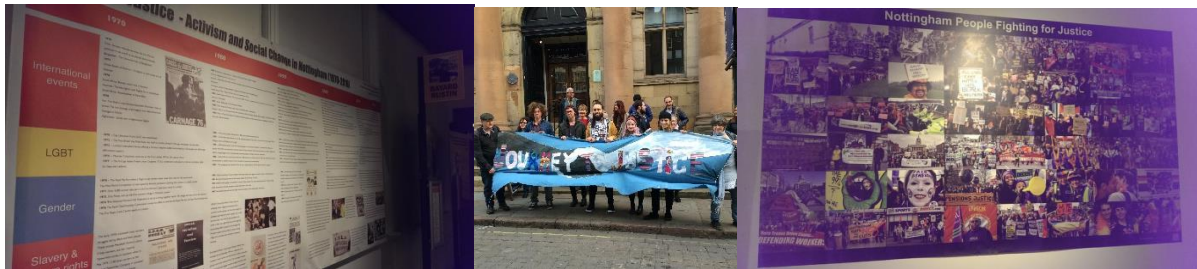
Nottingham: timeline of activism; outside the National Justice Museum; People Fighting for Justice

Our main activities centre on the Journey to Justice interactive multi-arts travelling exhibition which explores how advances in the protection of rights are hard won and cannot be taken for granted. Using inspirational stories from the US civil rights movement and UK struggles for freedom and justice, we tell stories of less well-known men, women and children who were involved rather than the famous leaders and we explore factors essential for a human rights movement to succeed.