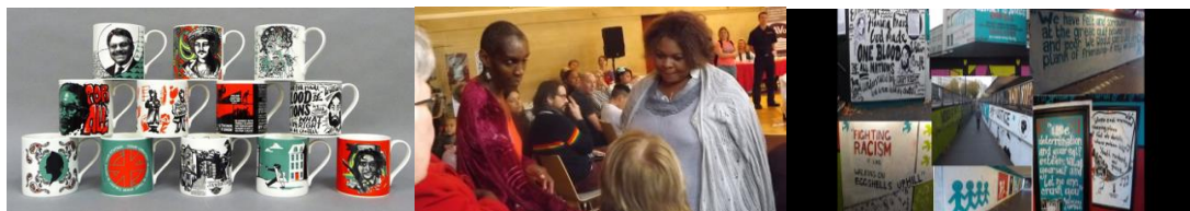
Ceramics, drama and street art in Bristol

We organised public events featuring community choirs, films, poetry, dance, photography, ceramics and visual arts connected to raising awareness of human rights issues and as a means of inspiring involvement and action. Our volunteers are key to planning and delivering all our programmes.