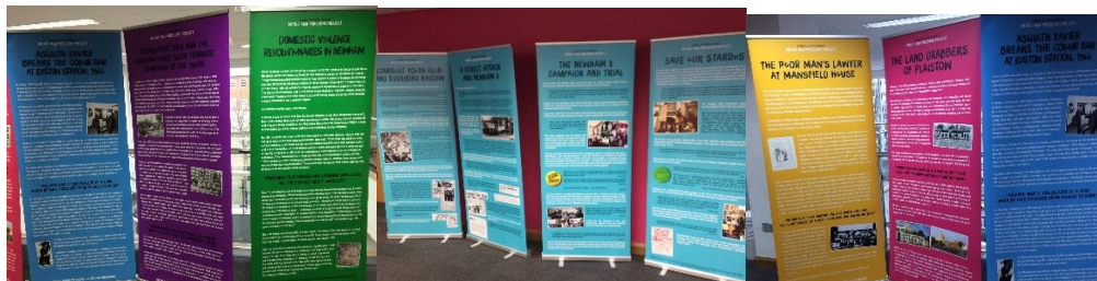
Telling local stories

Wherever the exhibition is displayed it includes a section telling local stories of social action from the past and present, often through the arts and researched by local people. The exhibition is a catalyst for a complementary education and arts programme which harnesses local energies and histories, planned and delivered by local partners and inspiring continued activity after it has gone. Between April 2017 and March 2018 we ran the project in Nottingham, Bristol and Newham in East London. For a film of the Newham launch go to https://vimeo.com/293990807 .