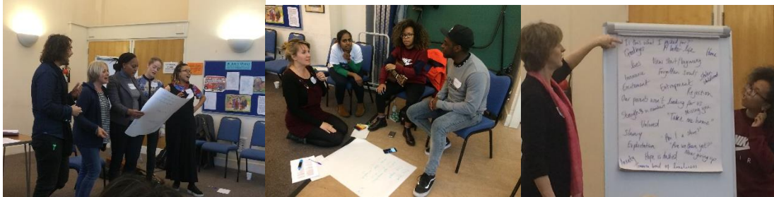
Training day for musicians and music teachers in Newham

We run training sessions for young people in schools, colleges, probation groups and with youth and community groups. We also provide Train the Trainers courses for teachers, artists, students, youth and community workers and others in order to embed our approach. These are sometimes run in partnership with likeminded organisations such as On The Record, Eclipse Theatre and Young Asian Voices.