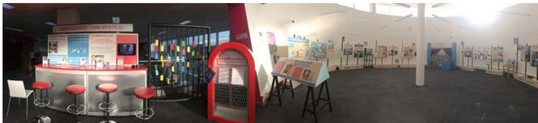
Panorama view of the exhibition at Beckton Globe Library, Newham

Our main activities centre on the Journey to Justice interactive multi-arts travelling exhibition which explores how advances in the protection of rights are hard won and cannot be taken for granted. Using inspirational stories from the US civil rights movement and UK struggles for freedom and justice, we tell stories of less well-known men, women and children who were involved rather than the famous leaders and we explore factors essential for a human rights movement to succeed.