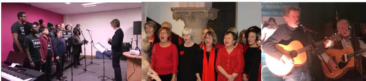
Song in Nottingham and Newham