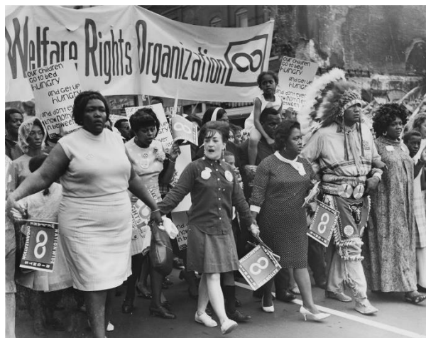
The National Welfare Rights Organization marching to end hunger as part of the Poor People's Campaign, 1968.