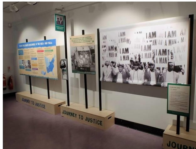
Seldom told stories from the US civil rights movement on 'bus stops' in our exhibition