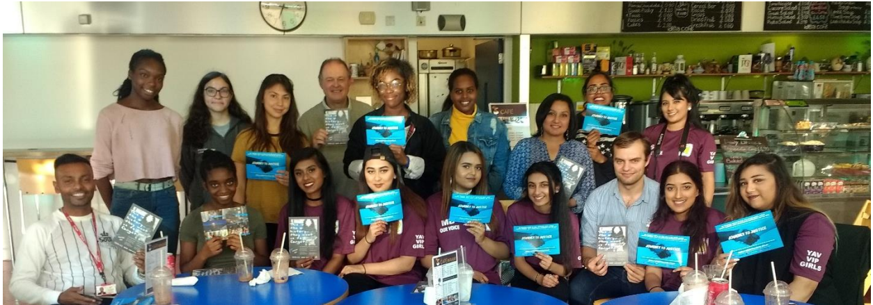
JtoJ volunteers with Young Asian Voices (YAV) from Sunderland, Fighting SUS and Girlz United gathering at Idea Store Library, Whitechapel, East London (August 2018)