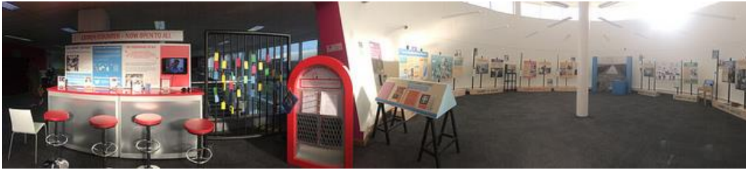
Panorama view of the exhibition at Beckton Globe Library, Newham