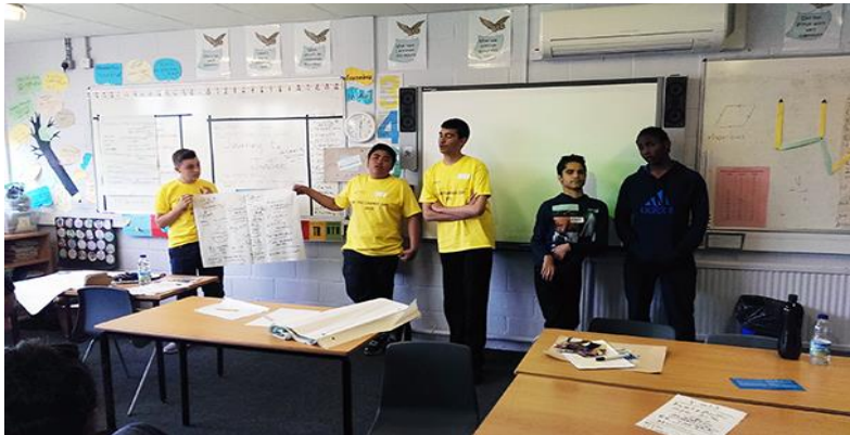
Northumberland Park Community School, Tottenham, 'Be the Change Day' workshop