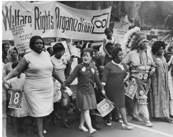
The National Welfare Rights Organization marching to end hunger as part of the Poor People's Campaign, 1968.