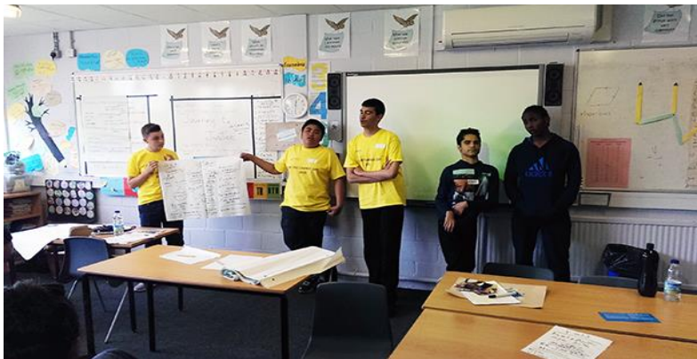
Northumberland Park Community School, Tottenham, 'Be the Change Day' workshop