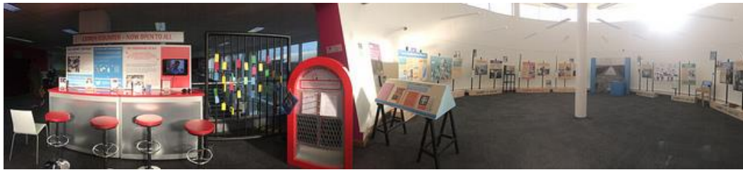
Panorama view of the exhibition at Beckton Globe Library, Newham

power but we are not party political. We welcome supporters of all political parties and views.