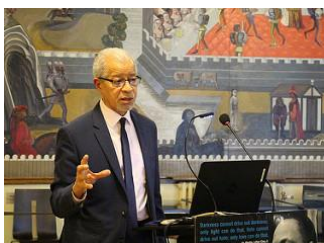
JtoJ patron Lord Herman Ouseley, JtoJ Morley College launch, MLK Day, January 2017