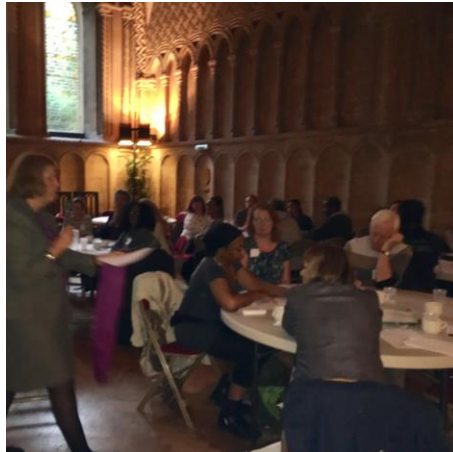
Bristol JtoJ taster at Bristol Cathedral, October 29 th 2016