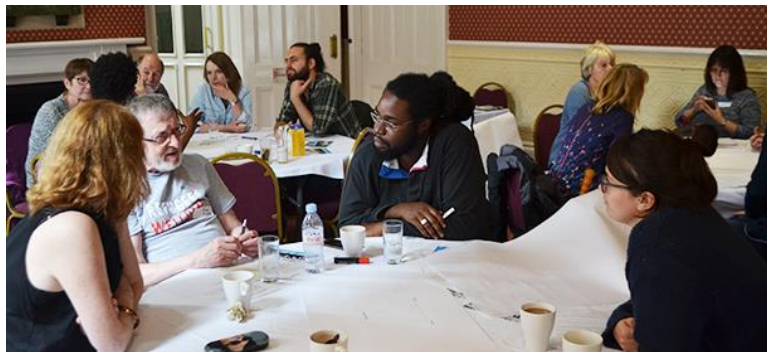
Nottingham JtoJ taster session at the Galleries of Justice, June 20 th 2016