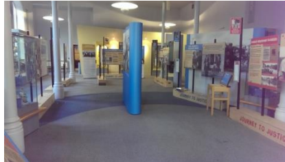
In the Pottery Gallery, Sunderland Museum & Winter Gardens, October 2016