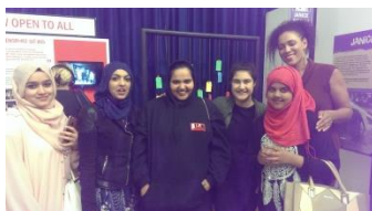
All in Youth Project, Middlesbrough at the launch of the JtoJ exhibition, Teesside University, October 6 th 2016

Volunteers from the University welcomed visitors including from the local FE College and refugee children and were on hand to answer questions. As part of the Teesside University JtoJ legacy project, students will identify films from local archives which illustrate Teesside's mighty history.