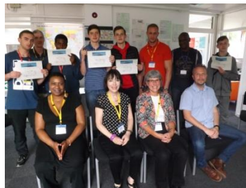
Staff, students, JtoJ facilitators and guest interviewers at City and Islington College, June 10 th 2016

On the last day, people from the worlds of journalism, advertising, business and education interviewed them and fed back their highly positive observations to each young person. All those interviewed achieved a 4 or 5 for employability (where 5 was the highest). Not only had they proved to themselves that they could successfully impress employers, but they had brought from hibernation strongly positive aspects of their own personalities that they could be proud of and express with confidence. With thanks to all the staff, students and interviewers who took part.