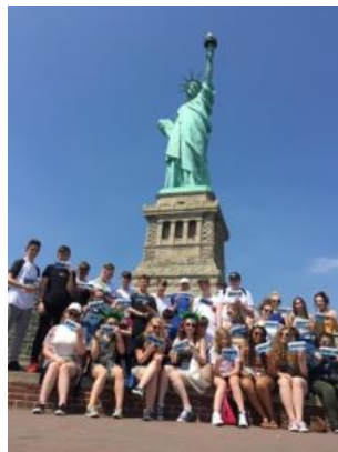
Students of Thornhill School, Sunderland supporting JtoJ in NYC, July 2016

Thornhill School is one of JtoJ's partners in Sunderland. In July 2016 its music department staff took 32 students to New York City. This chance of a lifetime visit enabled the young people to visit iconic sites - the Statue of Liberty, Empire State Building, Central Station, Central Park and the 9/11 memorial. Sunderland was featured in a New York Times article after the EU referendum and students wanted to make clear their support for the work of JtoJ and our focus on human rights.