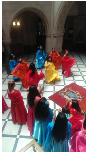
Romano Jilo dance group at Sheffield closing ceremony, June 26 th 2016