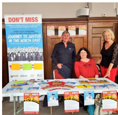
Newcastle JtoJ stall at Martin Luther King Peace Fair, June 7 th 2016