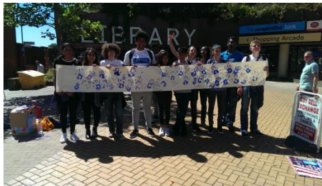
Summerfield Group at the National Citizen Service – The Challenge in Wood Green campaigning for Journey to Justice, July 2016