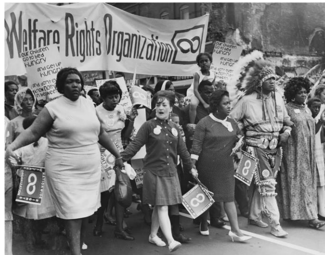
The National Welfare Rights Organization marching to end hunger as part of the Poor People's Campaign, 1968.

www.journeytojustice.org.uk Twitter @freedomandjobs E: info@journeytojustice.org.uk