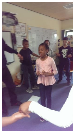
JtoJ with Poetic Unity at SHINE Saturday School, Brixton, June 2016