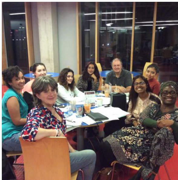
Members of the Tower Hamlets planning group at Idea Store, Whitechapel, September 2016