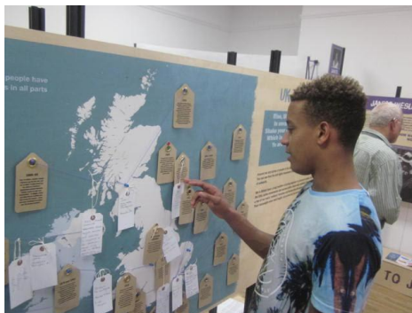
Visitor to the JtoJ exhibition at The Art House, Sheffield, June 2016